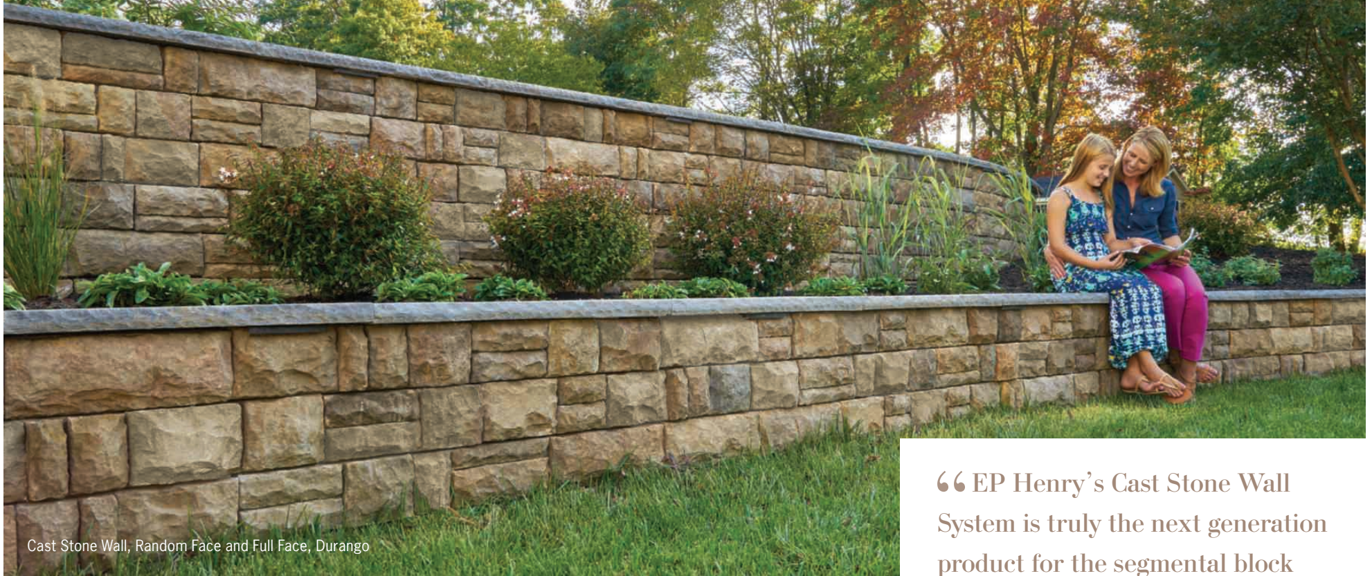
Cast Stone Wall, Random Face and Full Face, Durango

Inspired by Nature, Handcrafted by EP Henry