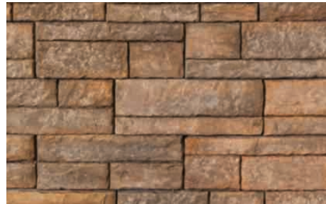
RANDOM FACE IN DURANGO