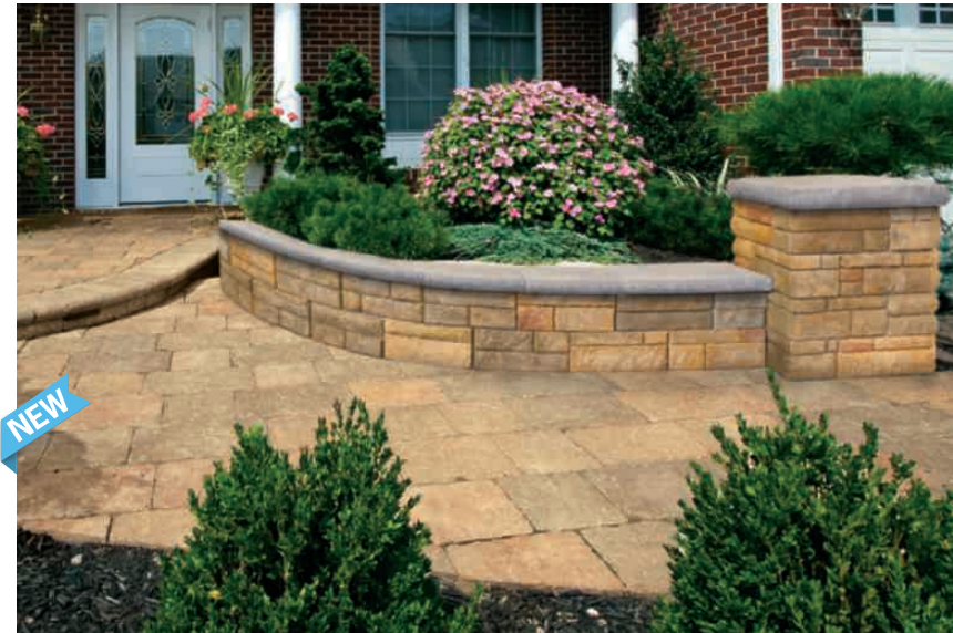
Cast Stone Wall Random Face, Durango; Coventry® Stone III, Running Bond Pattern