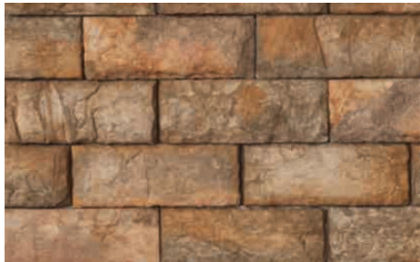
FULL FACE IN DURANGO