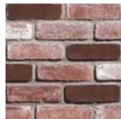
FENWICK AND FEDERAL HILL (COMBINATION)