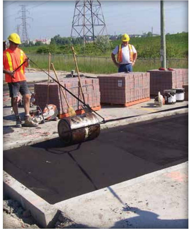
Figure 14. A water-filled roller compactor for compacting the bitumen-sand bedding.

Should the surface of the pavers be stained with adhesive during installation, it is very difficult to remove and fresh replacement pavers are required. In-service reinstatement of installed bitumen-sand set pavers is practically impossible because the bitumen-sand material adheres to the bottom of the pavers when removed. It is less expensive to discard the pavers rather than remove the asphalt from the units and attempt to reinstate them.