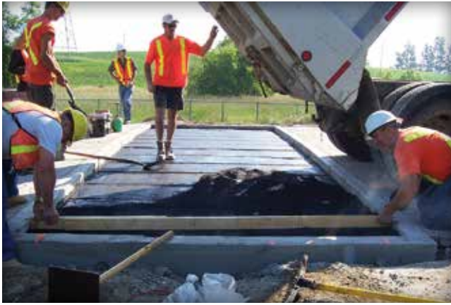
Figure 4. The hot bitumen-sand bedding material is dumped from a truck onto the concrete base.