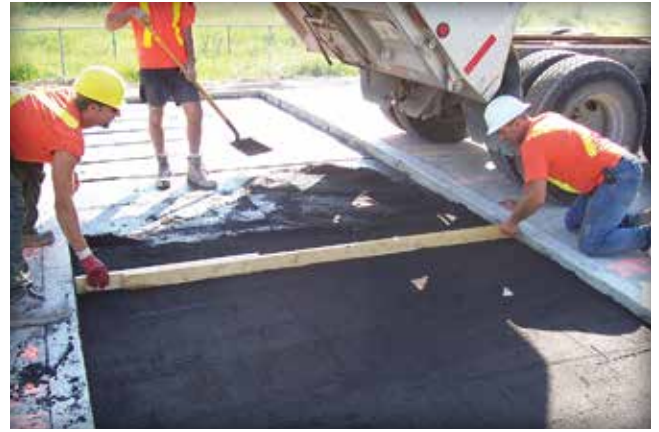
Figure 5. While the bitumen-sand is still hot, it is screeded to an uncompacted thickness of about \frac{3}{4} in. (20 mm).