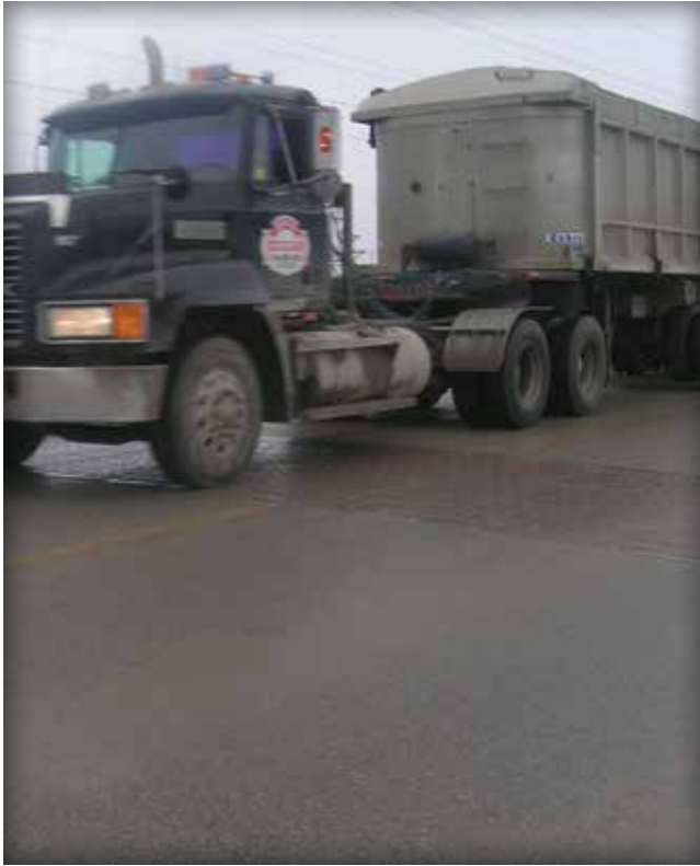
Figure 13. Crosswalk in use under heavy traffic.