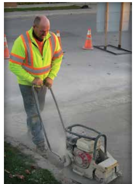
Figure 12. Once the pavers are in place, the joints are filled with dry joint sand and the surface is compacted.

A thin layer of neoprene-asphalt adhesive is then applied with a squeegee to the top of the bedding layer, and allowed to cure (typically 1 to 2 hours). Some adhesives are a more viscous and are applied with a straight edged towel as shown in Figure 8. The adhesive takes a hazy appearance when ready to mark baselines and place the concrete pavers (Figure 9). Only enough adhesive should be applied that will be covered with pavers in a day's work. Figure 10 shows the paver installation. Once the pavers are placed on the adhesive, they are very difficult to remove. If removed, they can pull up the adhesive and bitumen-sand bedding under the paver. Once all the pavers are in place including cut units, sand is swept into the joints and pavers are compacted until the joints are full (Figures 11 and 12). For more efficient work, sand sweeping and compaction can be simultaneous. Unlike sand-set pavers, there is no need to compact the pavers without sand in the joints first. When completed, the pavement can accept traffic loading immediately (Figure 13).