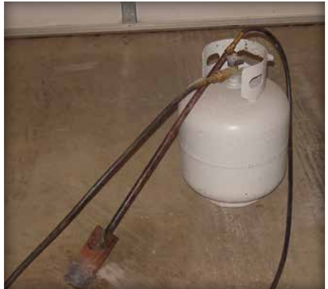
Figure 16. Occasionally, uneven bedding surface occurs and it is necessary to re-heat the bitumen-sand bedding with a propane heater tool.