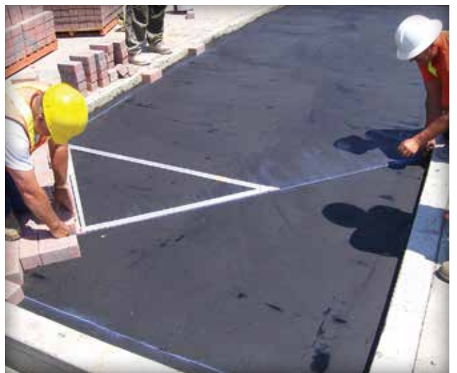
Figure 9. Perpendicular chalk lines are snapped and the pavers placed on the adhesive after the neoprene-asphalt adhesive dries (cloudy black surface).