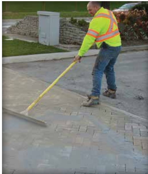
Figure 11. Sweeping in joint sand

The hot bitumen-sand bedding layer is placed, screeded to about \frac{3}{4} in. (20 mm) thick and compacted while remaining above 250° F (120° C) (Figures 4 and 5). This layer typically compacts about \frac{1}{8} in. (3 mm). The depth of this layer must be consistent. If the area does not have a curb to support a screed, screed bars are placed directly on the concrete base to guide the screed. The bars are removed immediately after screeding and the narrow void spaces left from the removed bars are filled with additional, hot bitumen-sand mix and troweled smooth. The compacted bitumen-sand bedding layer can compensate for only very small surface variations in the concrete base and cannot be used to make up for a rough surface finish on the concrete. The bitumen-sand mix is placed, screeded and