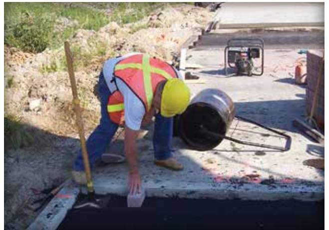
Figure 7. The compacted bedding elevation at the edge is checked with a paver.