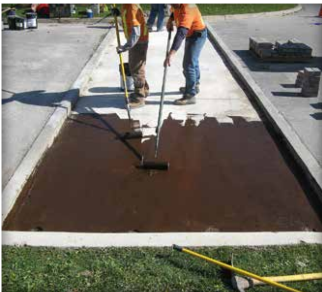
Figure 2. Emulsified asphalt tack coat is applied to a concrete base prior to applying the bitumen-sand mix.

Figures 2 through 12 demonstrate the bitumen-sand set interlocking concrete pavement installation sequence for