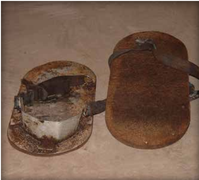
Figure 15. Walking on the hot bitumen-sand bedding with regular construction grade, steel-toed boots is discouraged. For limited walking on this layer, workers should wear boot sole covers shown here that resist damage and better distribute weight to prevent dentations.