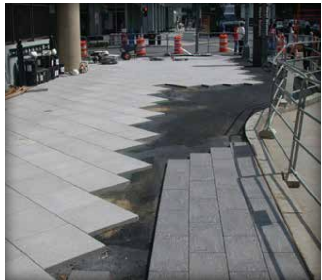
Figure 18. Paving slabs adhered to a bitumen-sand bedding in a Washington, DC, sidewalk.