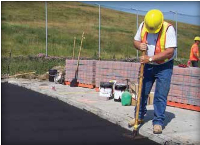
Figure 6. A hand tamper is used to compact in areas that cannot be reached with the roller compactor.