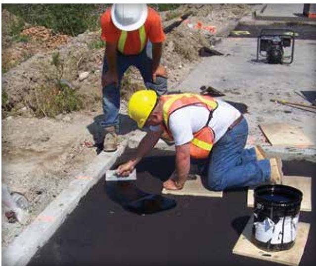
Figure 8. After the bitumen-sand mix cools, a 2% neoprene-asphalt adhesive is applied. The material can be trowel-applied as shown here. Some materials are more viscous and can be spread with a squeegee.