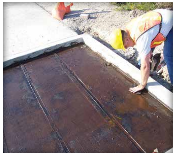
Figure 3. Control joints and drain holes are covered with geotextile. Drain holes are provided for any water that manages to enter the pavement surface.

Best application results are typically achieved using a synthetic paint roller with a short nap. Once applied the tack coat should not be disturbed and should be allowed to cure before covering with the setting bed material. As the asphalt emulsion cures it should turn from a brown to black color (Figure 3). This may take a few hours depending on weather conditions. When using SS-1 and SS-1h asphalt emulsions the temperature should be between 70 and 160° F (20 to 70° C) to allow for proper curing. Asphalt