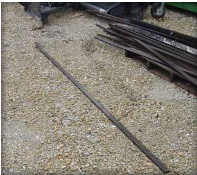
Figure 17. On larger projects, 1/2 in. (13 mm) thick steel screed bars are placed on the concrete base to ensure a uniform bitumen-sand bedding thickness.