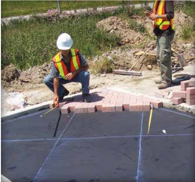
Figure 10. Cut pavers are added along the edges.

tack coats are recommended for vehicular applications. They are typically not required in pedestrian applications.