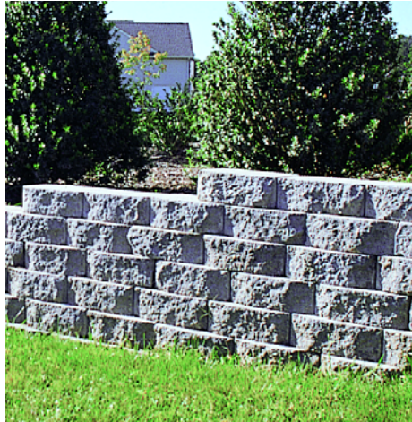
Gray Nursery Stone

Using a chisel or splitter, remove 3"- 4" from the end of a rectangular unit. This end should have the same rough "rockface" as the front.