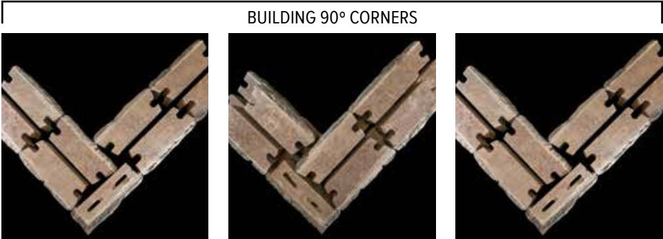
BUILDING 90° CORNERS

NOTE: DOUBLE SIDED CAST STONE WALL™ MAY ALSO BE TERMINATED BY BUILDING A COLUMN AT THE END OF THE WALL USING SINGLE SIDED CAST STONE WALL™ CORNER UNITS WITH THE COLUMN CAP.